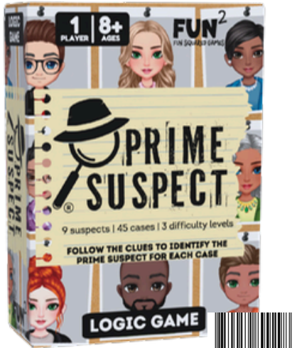
Original SKU 3001

Follow clues to arrange suspects in a 3x3 grid and identify the PRIME SUSPECT at the center Includes 45 unique case cards and 1 set of suspect tiles for individual or collaborative play