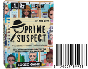
In the City SKU 3005