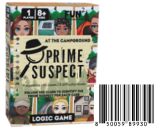
At the Campground SKU 3003