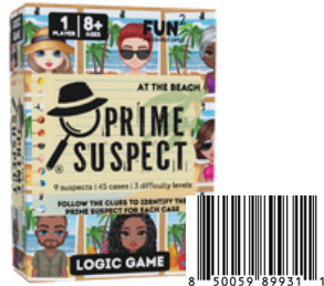
At the Beach SKU 3002