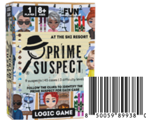
At the Ski Resort SKU 3004